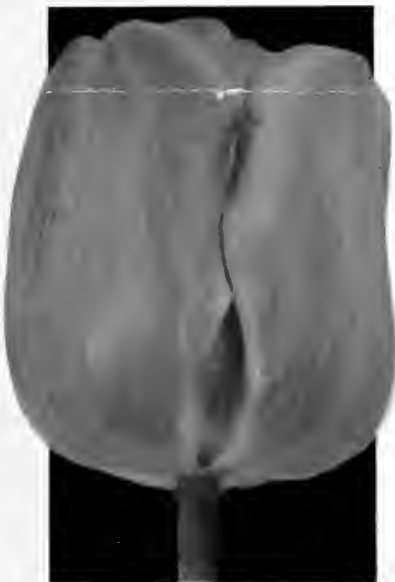
BARONNE DE LA TONNAYE Per doz., 55c; per 100, $4.20; per 1000, $34.00

STUPENDOUS FREE OFFER: With every order for $5 and names and addresses of two of your friends who love flowers, mailed to our office in Cheswick, Penna., on or before September 15, 1931, we will send you, absolutely FREE, 10 first-class Tulipa multiflora, pure white, changing to rich pink, the famous Schenley Gardens variety which produces 4 to 8 flowers per bulb, heretofore sold at $2 for 10 bulbs.